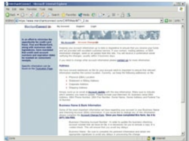
Account Update Function

My Account provides you with fast access to all the information you need to manage your account and ensure that you receive the best possible service. This section allows you to view or update your merchant profile, view your online statements, maintain account information, request new products, and receive equipment shipment status.